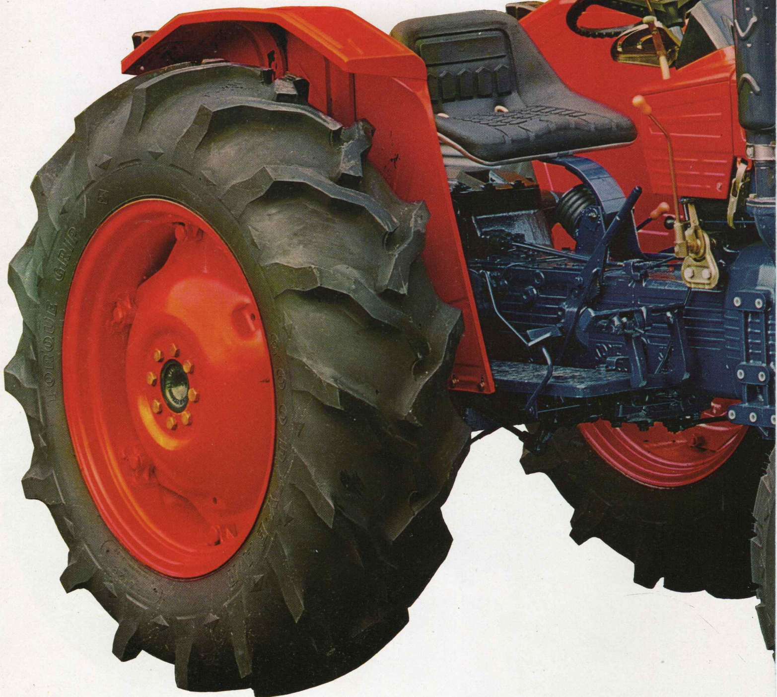
2-wheel drive model