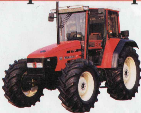
'Top' Cabin Series 80-90 HP range

T op in value SAME's new Explorer range of 80 and 90 HP cabin tractors now feature high - visibility bonnets. Economic, modern and reliable SAME 1000 series air/oil cooled engines provide class leading fuel economy.