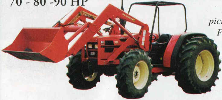
Explorer ROPS pictured with Pearson Front End Loader

Check out SAME'S Fantastic Loader Deals Available on All Models