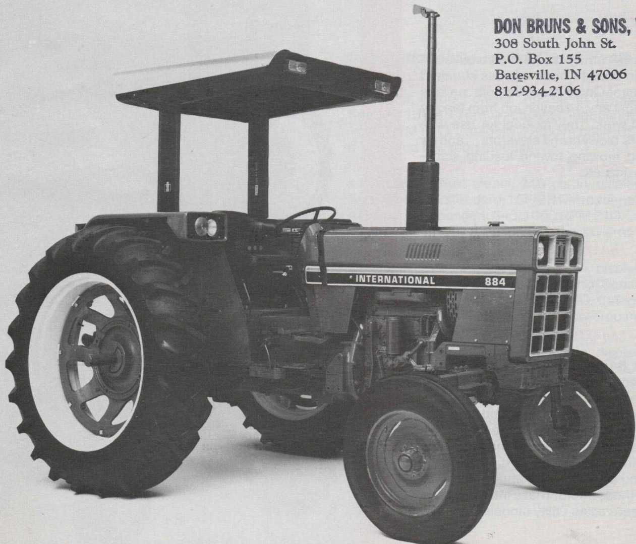
International 884 Row Crop Tractor

DON BRUNS & SONS, INC. 308 South John St. P.O. Box 155 Batesville, IN 47006 812-934-2106