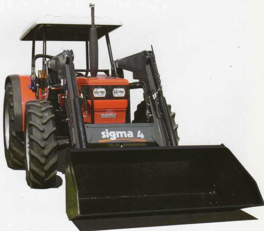
SAME Explorer 95