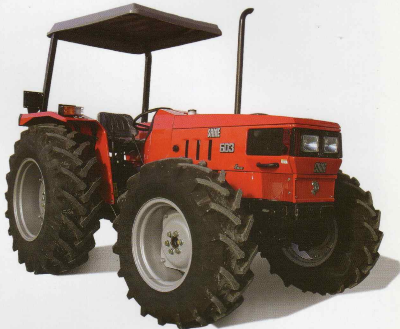
SAME Commando 603

The modern design includes high pressure injection systems with individual pumps that deliver considerable torque rise (up to 34%) and also ensures fuel consumption and maintenance costs are kept to an absolute minimum.